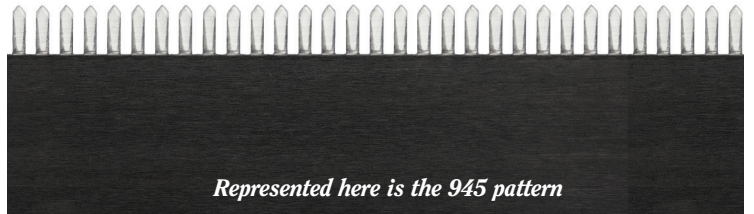
Represented here is the 945 pattern

The 5 patterns of the New PERFormaX family: